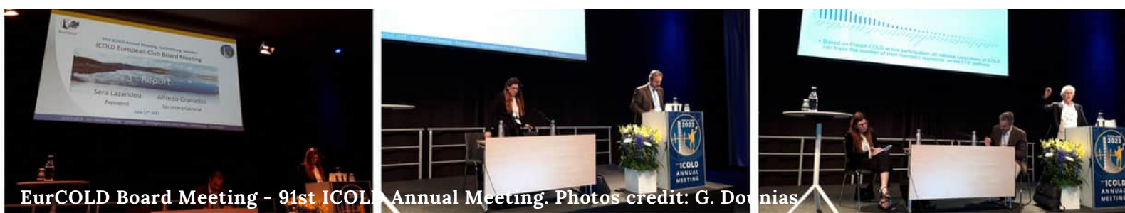
EurCOLLD Board Meeting - 91st ICOLD Annual Meeting.