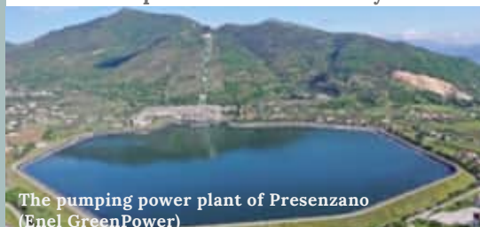
The pumping power plant of Presenzano (Enel GreenPower)

Workshop “Dams and Territory - The context of central-southern Italy”