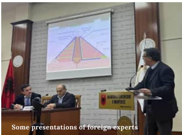
Some presentations of foreign experts