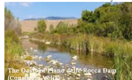
The Oasis of Piano delle Rocca Dam (Consorzio Vela)