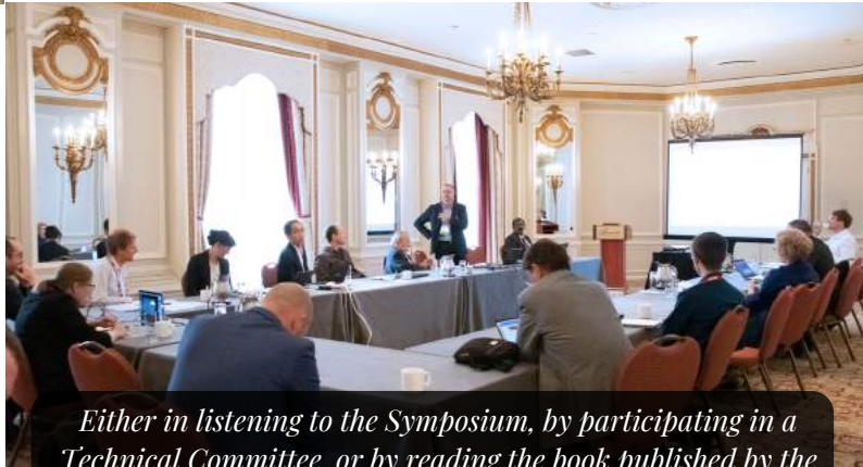
Either in listening to the Symposium, by participating in a Technical Committee, or by reading the book published by the Canadian Dam Association, the delegates were able to deepen their technical knowledge

The two-day Symposium on Wednesday and Thursday addressed the theme “Sustainable and Safe Dams Around the World.” Nearly 400 submissions were received, over 300 papers were published in the Proceedings, 198 oral presentations and approximately 70 posters were made in Ottawa. The Technical Papers are available for a limited time at www.icold-cigb2019.ca .