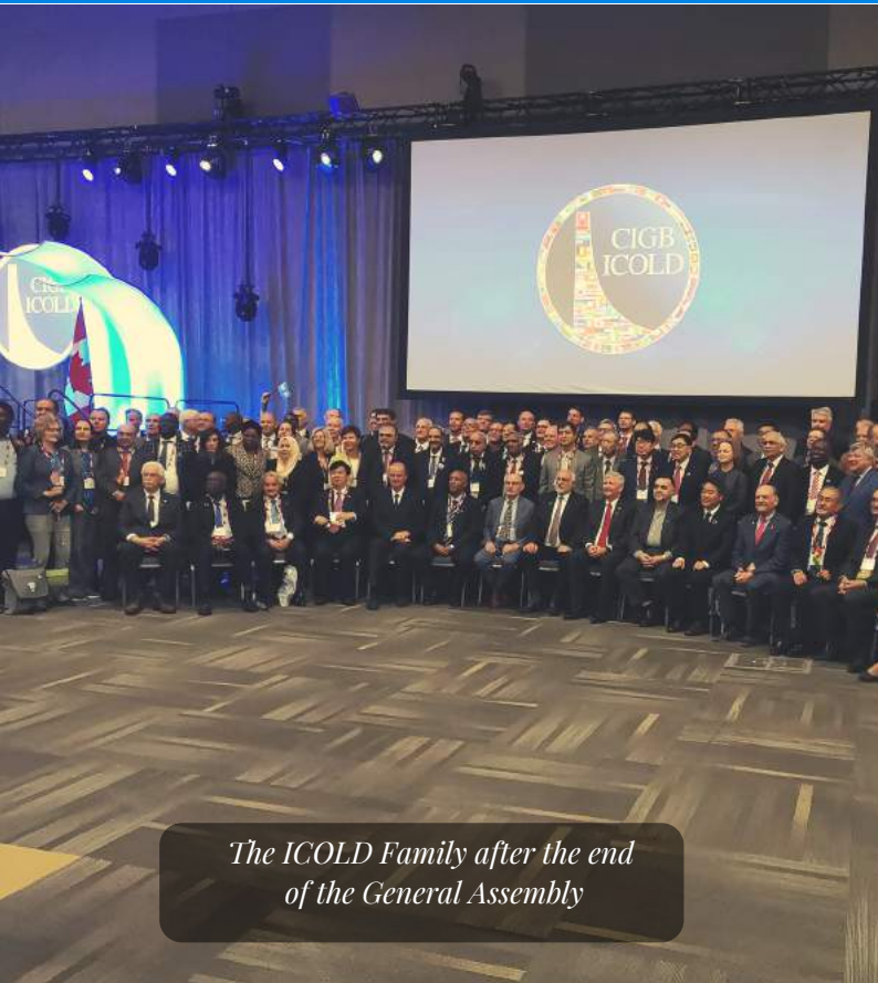
The ICOLD Family after the end of the General Assembly