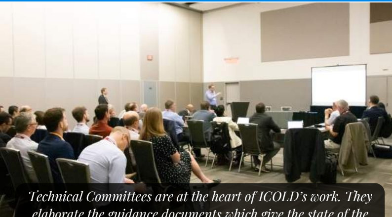
Technical Committees are at the heart of ICOLD's work. They elaborate the guidance documents which give the state of the art on a specific subject.