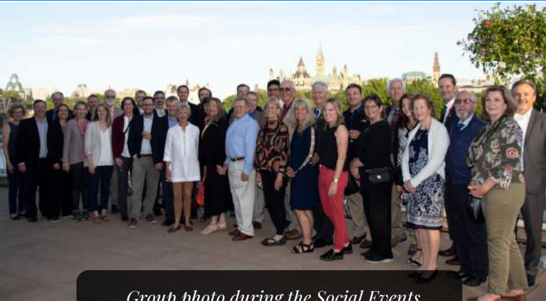
Group photo during the Social Events