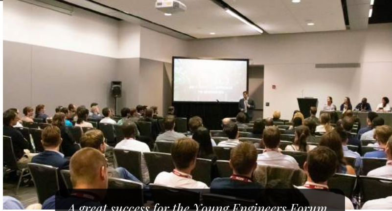
A great success for the Young Engineers Forum